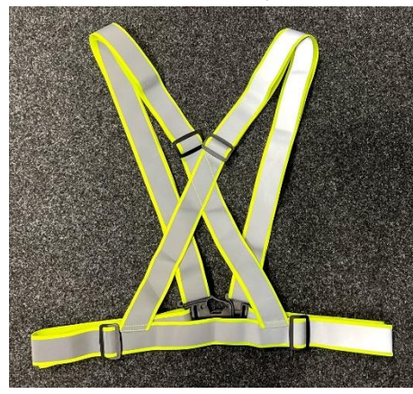
Cross body belt 22-W-01, back