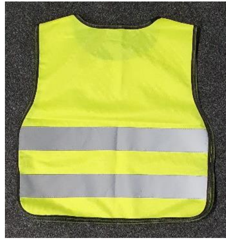
Reflective vest 22-W-02, back