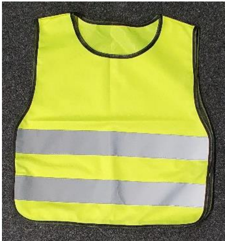
Reflective vest 22-W-02, front