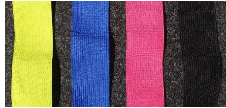
Colours of cross body belt 22-W-01