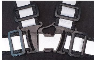
Buckle on crossbody belt 22-W-01