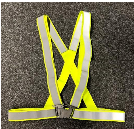
Cross body belt 22-W-01, front (for buckle, see picture below)